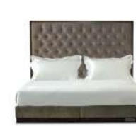
STATE BED 01